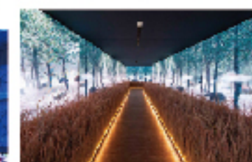
Photographed / Text = Wilson Chang