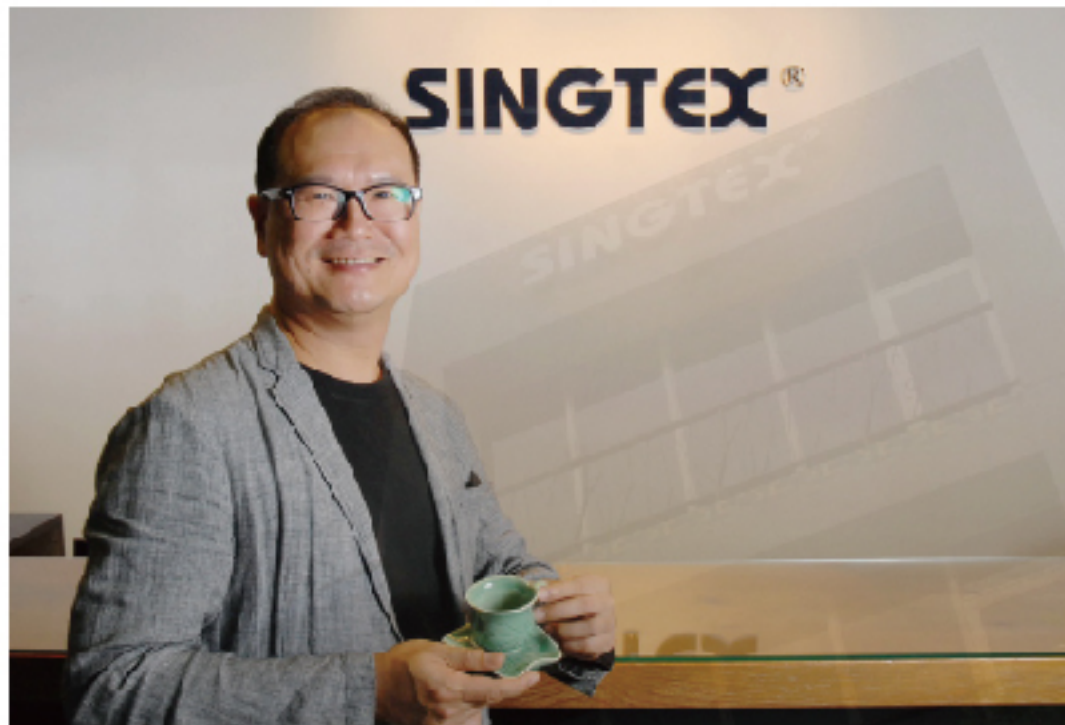
We need to overcome difficulties, not be overcome by them.