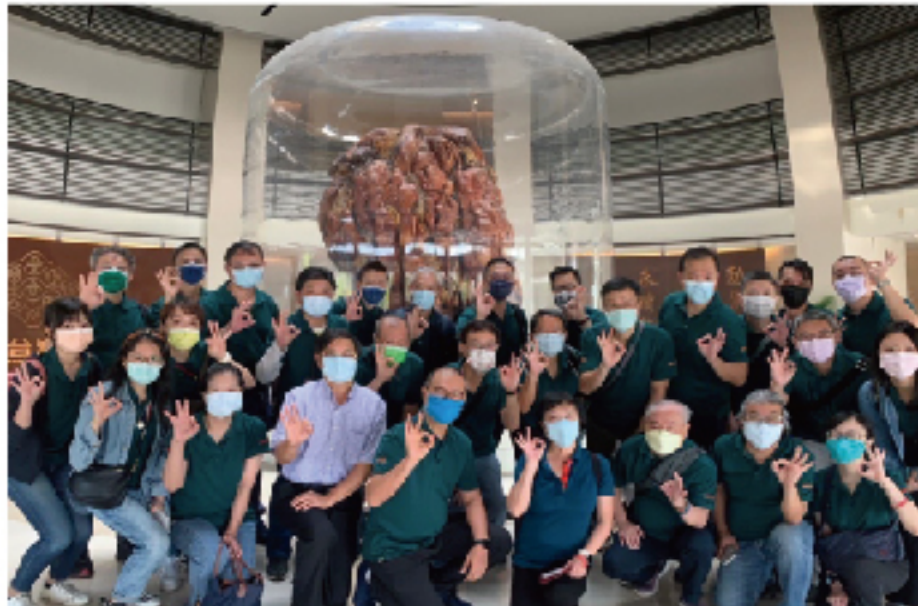
Photographed / Text = Dawn Lin

SINGTEX invited a total of 28 senior executives as the first delegation to visit Formosa Plastics for learning and observation on October 2. The second delegation is scheduled for November. Other colleagues will be invited to this educational itinerary.